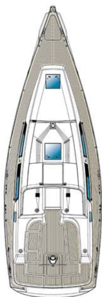
OPTION A2 | B1 | C2 1